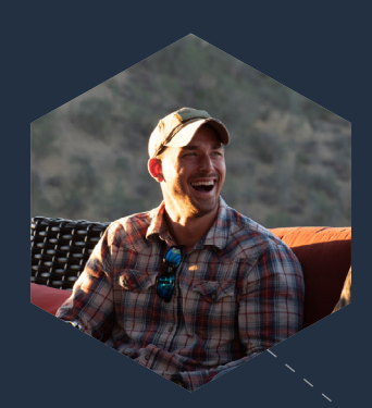
Over $4 Million invested in helping warriors in 2023. At NO COST to them.