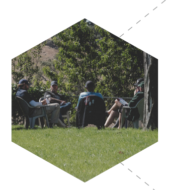
51 Active Mighty Oaks Outposts providing Aftercare to 257 individuals on average