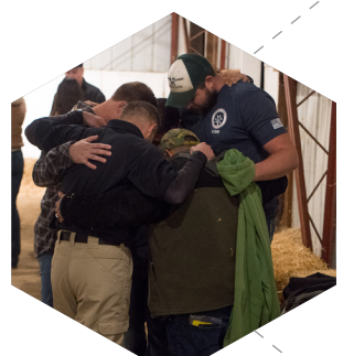
58% Are studying their Bible daily20% Are praying daily85% Attend church regularly43% Have weekly accountability